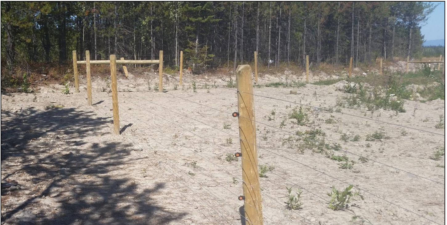
Figure 1. Fence style to be duplicated.