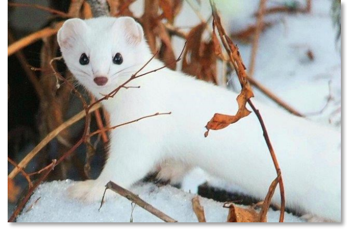
2nd Place - Linda Cutsforth