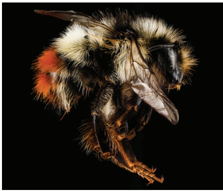
Yellow-fronted bumblebee Bombus flavifrons