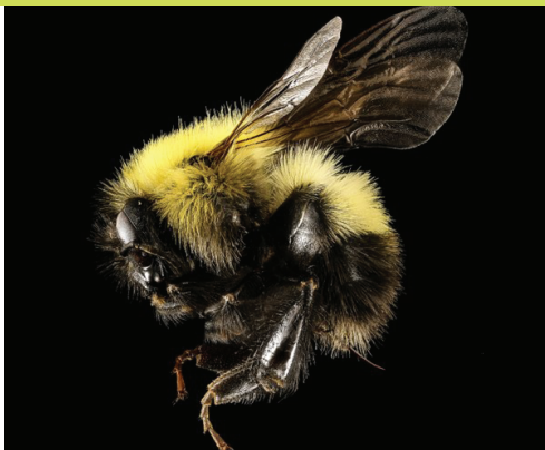
Perplexing bumblebee Bombus perplexus