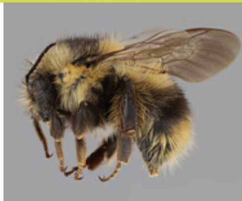
Fuzzy-horned bumblebee Bombus mixtus