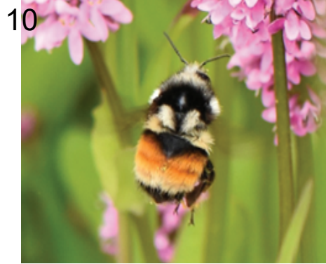
Vancouver bumblebee Bombus vancouverensis nearcticus