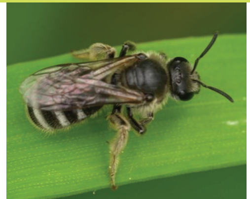
White-banded Sweat bee Lasioglossum leucozonium