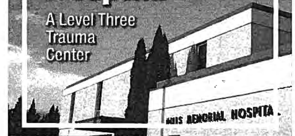
New Construction Catch - Conceptual Massing