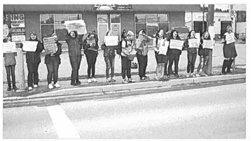
NVSS students participate in the Global Climate Strike on Sept. 27, 2019.