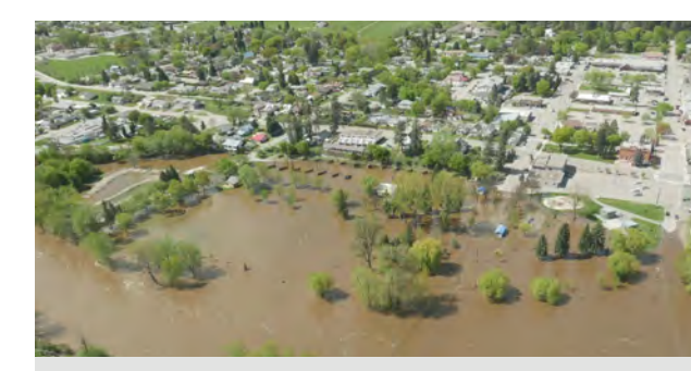
2018: Severe flooding occured in and around the city of Grand Forks, damaging more than 400 homes and 100 businesses.