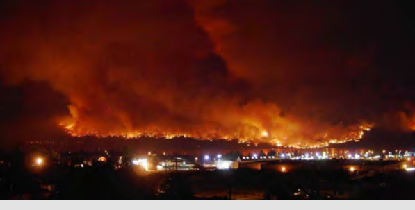
2003: The Okanagan Mountain Park wildfire in Kelowna burned over 25,900 hectares and over 33,000 people were forced to evacuate.