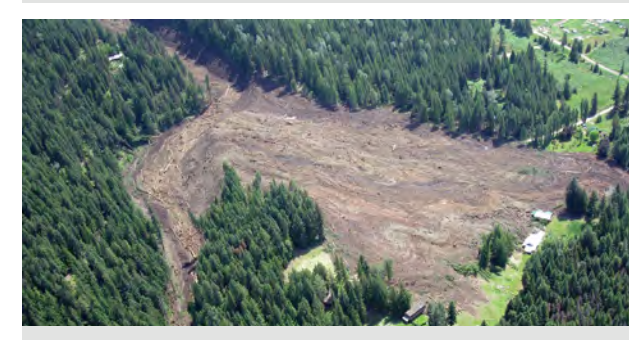
2012: A landslide severely impacted the community of Johnsons Landing, causing four deaths and completely destroying four homes.