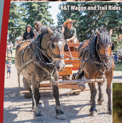
B&T Wagon and Trail Rides