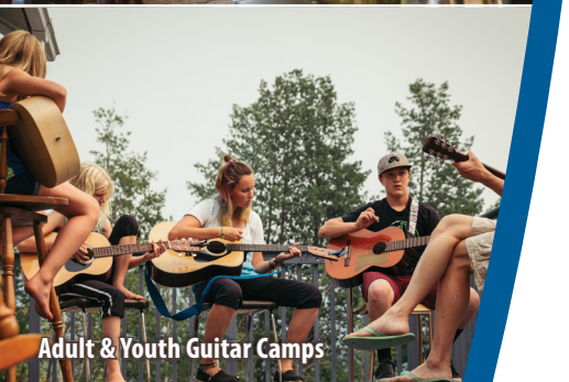
Adult & Youth Guitar Camps