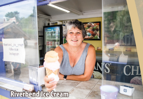
Riverbend Ice Cream