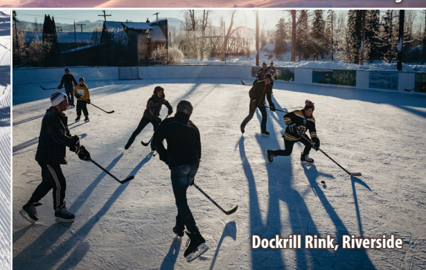
Dockrill Rink, Riverside