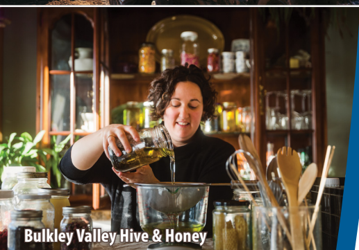
Bulkley Valley Hive & Honey