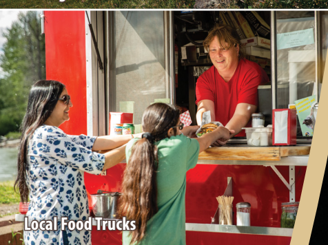
Local Food Trucks

Telkwa sits on the traditional territory of the Gitdumden Clan of the Witsuwit'en people, a Carrier people of the Athabaskan language who live on the Bulkley River and around Broman Lake and Francois Lake in the northwestern and central interior of British Columbia.