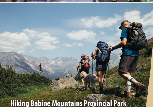
Hiking Babine Mountains Provincial Park