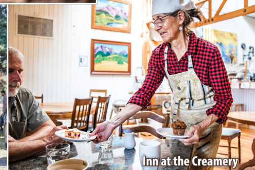
Inn at the Creamery