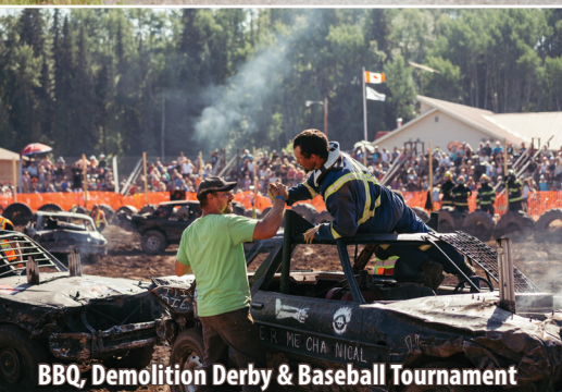
BBQ, Demolition Derby & Baseball Tournament