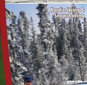
Nordic Skiing & Snowshoeing