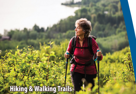
Hiking & Walking Trails