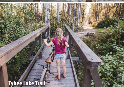
Tyhee Lake Trail