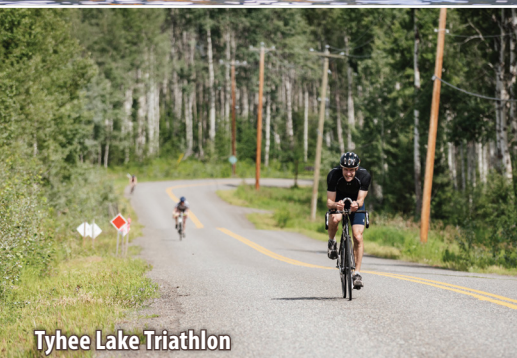
Tyhee Lake Triathlon