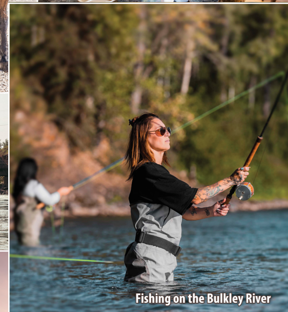
Fishing on the Bulkley River