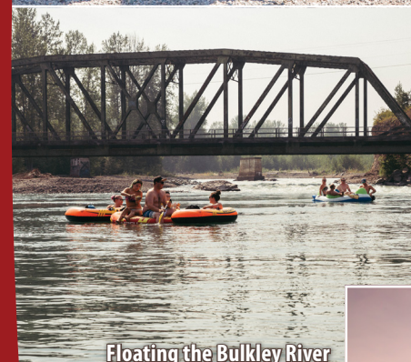
Floating the Bulkley River