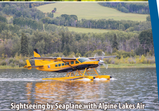
Sightseeing by Seaplane with Alpine Lakes Air