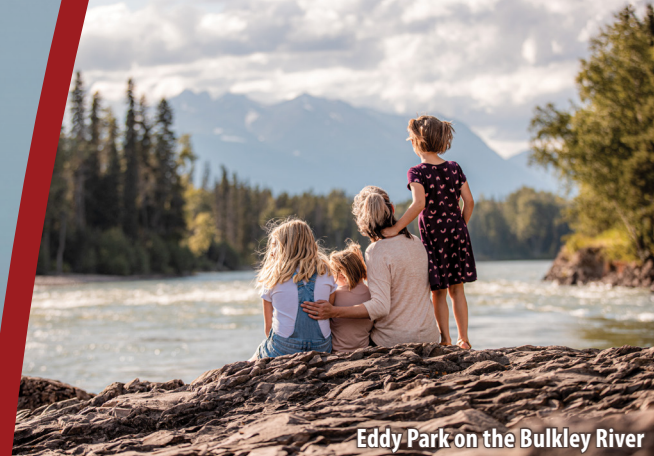
Eddy Park on the Bulkley River