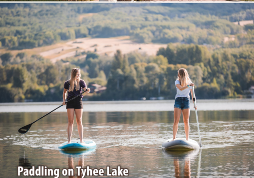
Paddling on Tyhee Lake