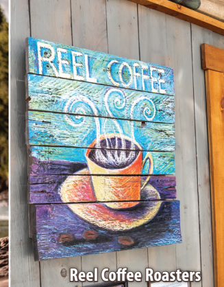
Reel Coffee Roasters