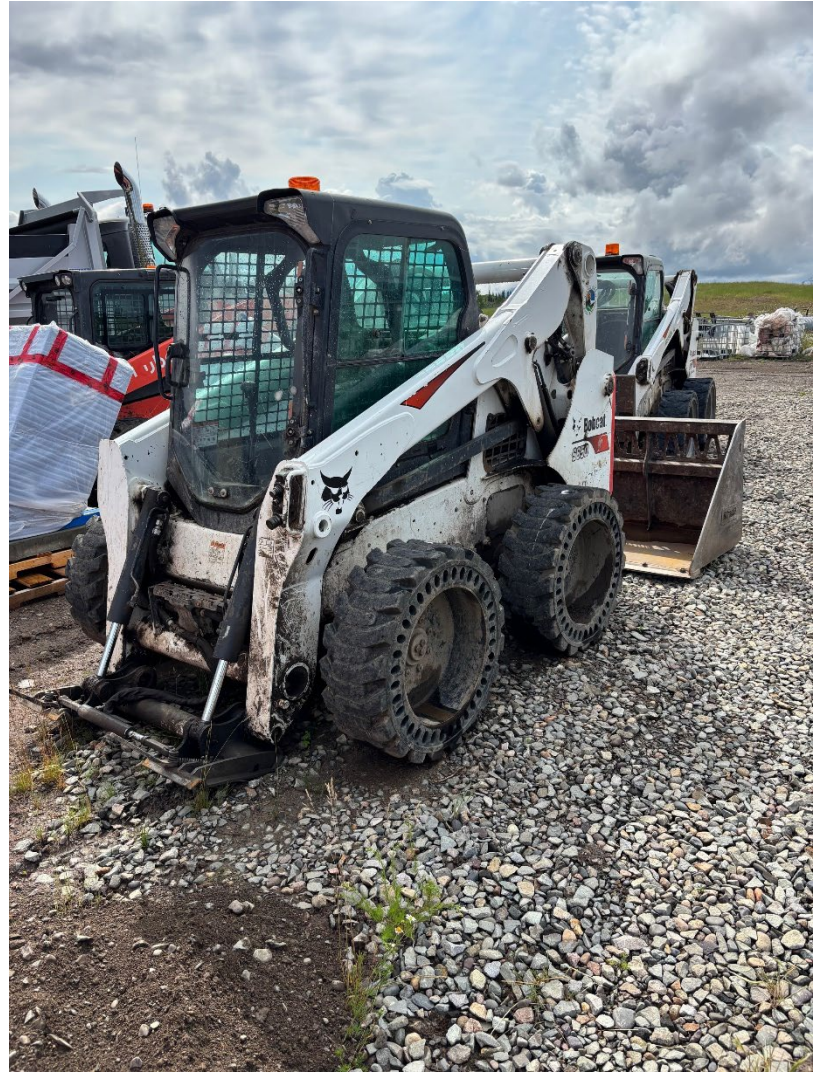
Operational 2017 Bobcat S650