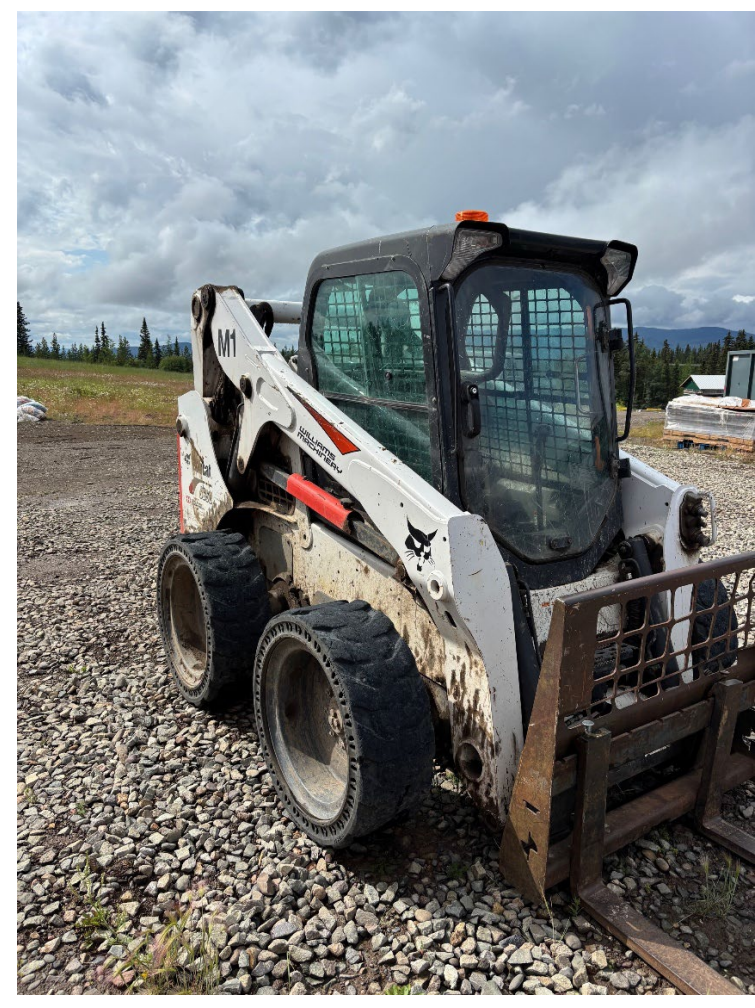
Operational 2019 Bobcat S650