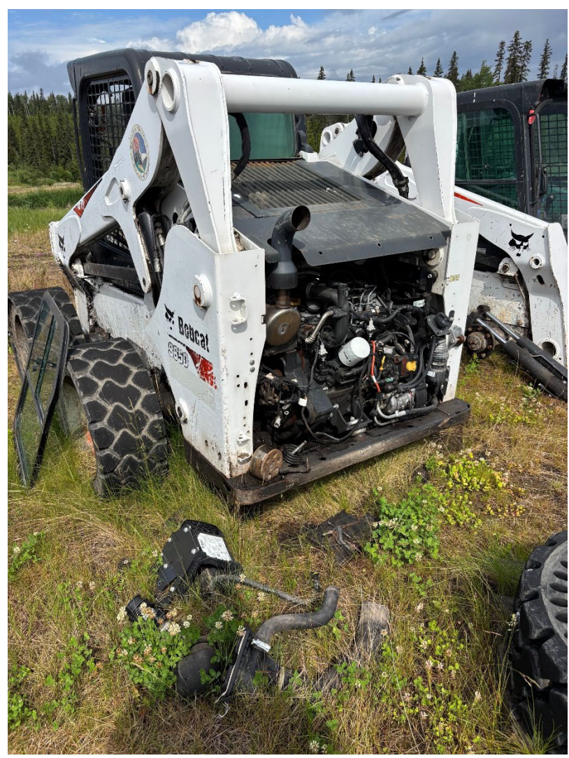
Parts 2018 Bobcat S650