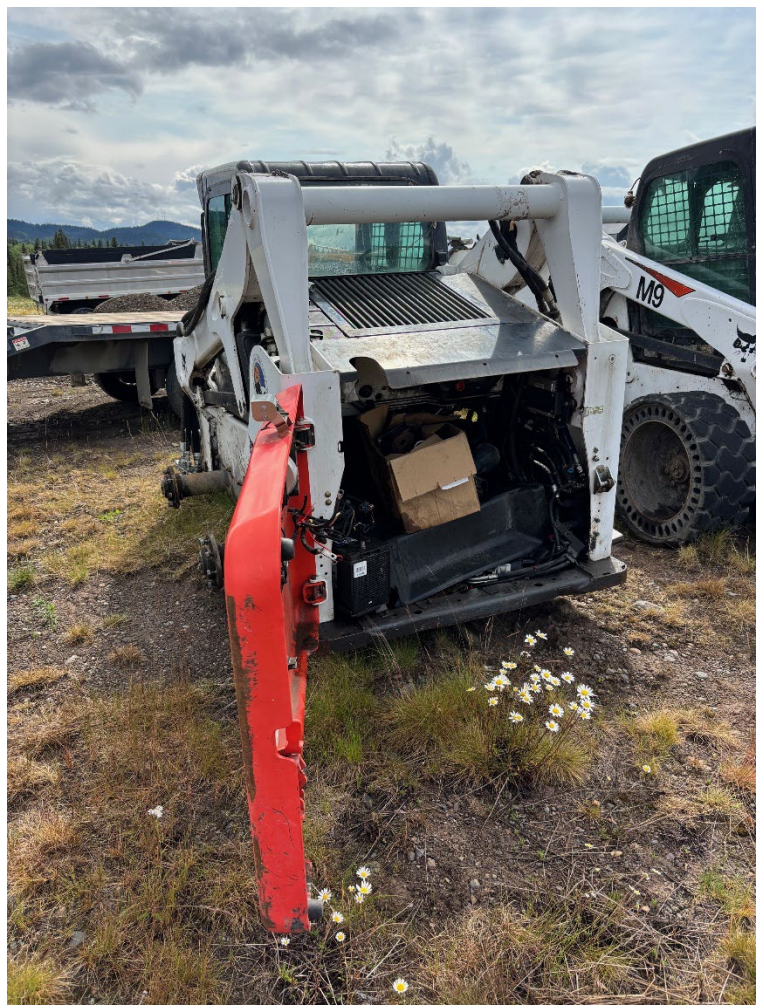
Parts 2016 Bobcat S650